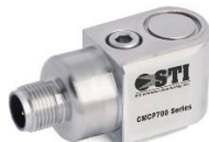
CMCP422ATS-XX-X-M12 M12 Eurofast Connector