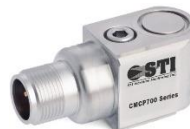
CMCP422ATS-XX-X-C 2 Pin MS 5015 Connector