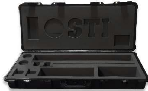
CMCP601-CC-L Hard Travel Case for Long Base Kit