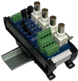
CMCP300P 4 Channel Sensor Power and Interface Module, for +24V, -24V or IEPE Driven Sensors, DIN Rail mountable