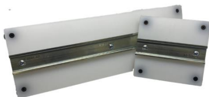
CMCP300P-PLATE-L Mounting Plate Large, 5x15", with Din Rail (For up to 2 CMCP300P's and 7 Proximitors)