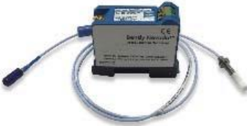
CMCP601-EP-1 Eddy Probe Set, 200mV/mil, 5mm, Includes Proximitor and Eddy Probe with 1 Meter Cable