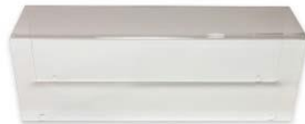
CMCP601-C-LB Plexiglass Safety Cover for Long Base Kit