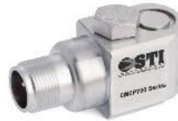
CMCP780A Compact Accelerometer, Side Exit, 100mV/g, 2 Pin MS 5015 Connector