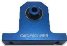
CMCP601-REB Rolling Element (Ball) Bearing Stand