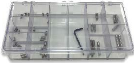
CMCP601-WKF Weight Kit Refill