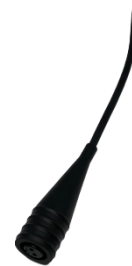
CMCP602LST-05 Accelerometer Extension Cable, 1 Meter Long, Blunt Cut (See CMCP602 Datasheet for more Options)