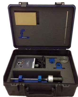
Shown above: CMCP601-01 Short Base Rotor Kit in CMCP601-CC-S Hard Travel Case

Overall Height: 3.0" (76.2mm) Shaft Centerline: 2.0" (50.8mm) Width: 0.75" (19.0mm) Thrust Mounting Hole: ¼"-28 UNF Through Hole Intended Thrust Position Target: Balancing Wheel (Perpendicular to Wheel) Eccentricity Mounting Hole ¼"-28 UNF Through Hole Intended Eccentricity Target: Shaft (Perpendicular to Shaft) Weight: 0.5 Lbs. (0.227kg)