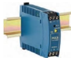
CMCP515-0625 Power Supply Universal 24 VDC, 625mA (0.625A) Capability