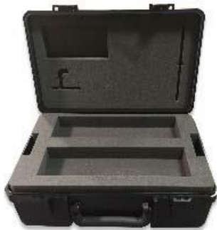
CMCP601-CC-S Hard Travel Case for Short Base Kit