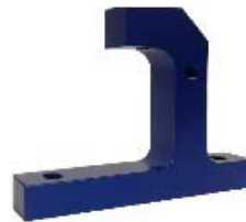
CMCP601-TEB Thrust/Eccentricity Measurement Bracket