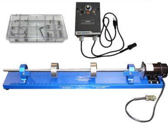
CMCP601-02 Long Base Rotor Kit